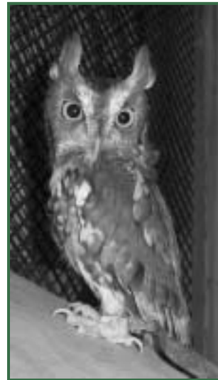
Ciça—our new Eastern Screech Owl

The Audubon Center would like to thank the following organizations that contributed financially to the new raptor mews: BirdxBird, Minnesota River Valley Audubon Chapter, St. Paul Audubon Chapter, Minnesota Ornithologists Union, St. Anne’s School, Marshall School, Central Minnesota Audubon Chapter, and everyone who adopted a raptor over the last year.