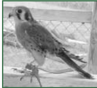
Nero—our new American Kestrel