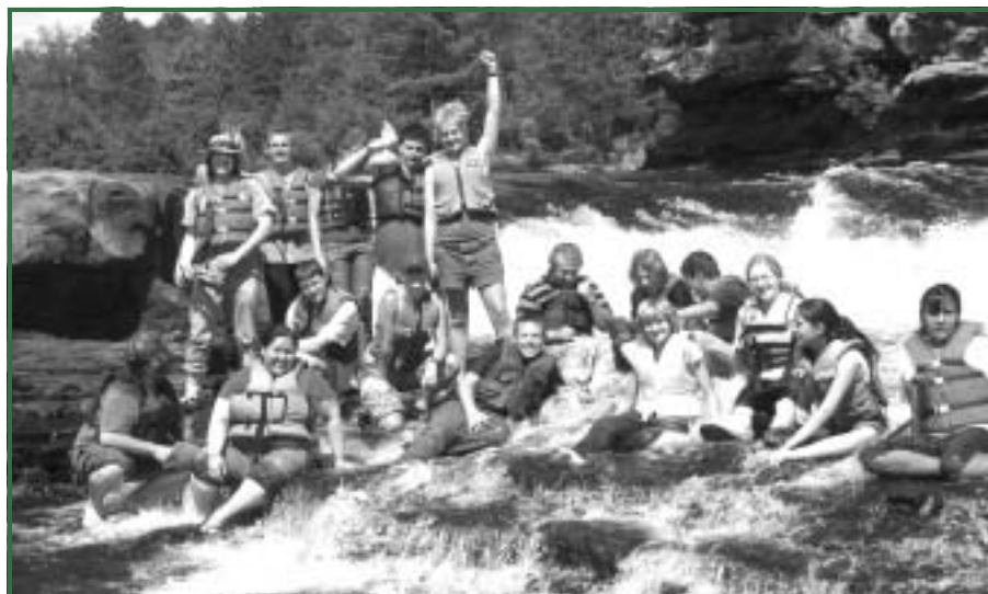
2007 Sensational Science campers at the Kettle River

In June, our summer staff welcomed 47 summer campers – 16 high school students for Sensational Science Camp and 30 elementary school students for Awesome Adventure Camp. Campers traveled from all over Minnesota and from as far away as Chicago and Massachusetts. Riverway and Aurora Charter Schools sent students and two supervisors from each school for the week of camp.