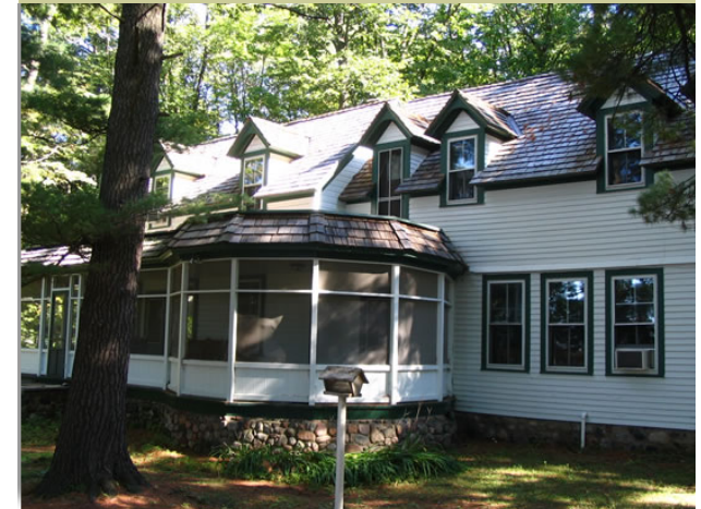
Historic Schwyzer Lodge on Grindstone Lake

Audubon Center of the North Woods 888-404-7743 or 320-245-2648 fenner@audubon-center.org www.audubon-center.org