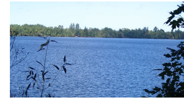
Late summer view of Grindstone Lake