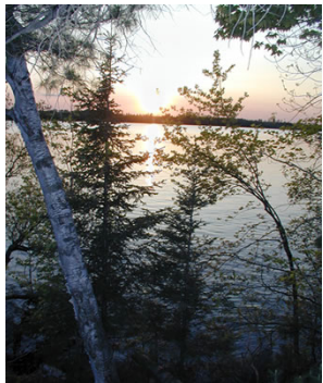
Sunset over Grindstone Lake

Situated on the shores of beautiful and mysterious Grindstone Lake, and surrounded by a 530 acre wildlife sanctuary, the historic Schwyzer Lodge is