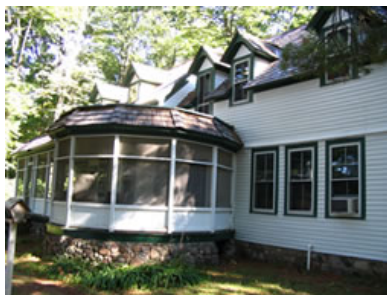
Lakeside view of Schwyzer Lodge & porch

For any season and any reason, the Schwyzer lodge is the perfect place for your North Woods getaway.