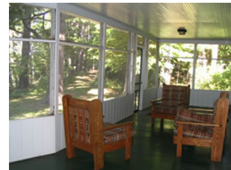
Everyone's favorite: the Schwyzer porch