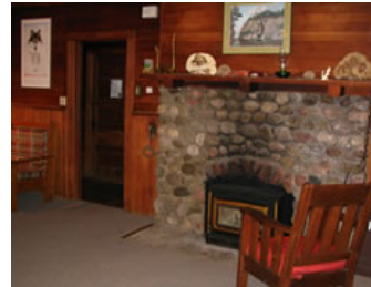
Schwyzers cozy fireplace