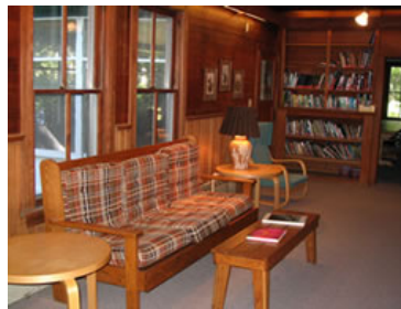
Gather in the living room, complete with library and fireplace